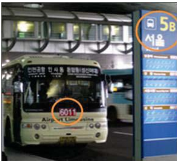
Bus stop 5B, bus 6011

* Note: From Incheon International Airport, the first bus departs at 05:40 and the last one at 22:40.