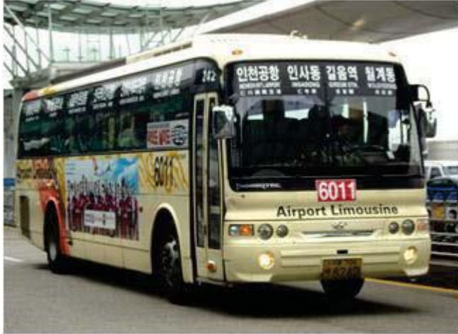
Airport limousine 6011

There are three ways to get from Incheon International Airport to the Humanities and Social Sciences Campus: airport limousine, subway and taxi. Considering travelling time and cost, we highly recommend that you take the airport limousine bus. The subway is cheap and good, but transferring at Seoul Station is rather complicated. Taxis are too expensive.